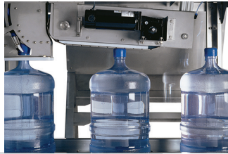
BOTTLED WATER FILL LINES