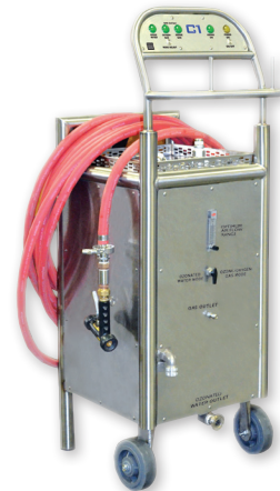
C-Series Mobile Disinfection Cart