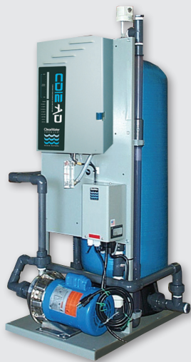
POE12 Ozone System