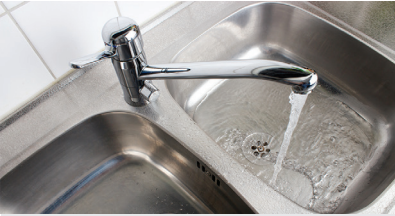
WELL WATER TREATMENT