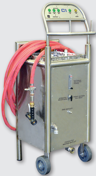
Hose and wash gun not included