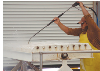
ALL SURFACE CLEANING